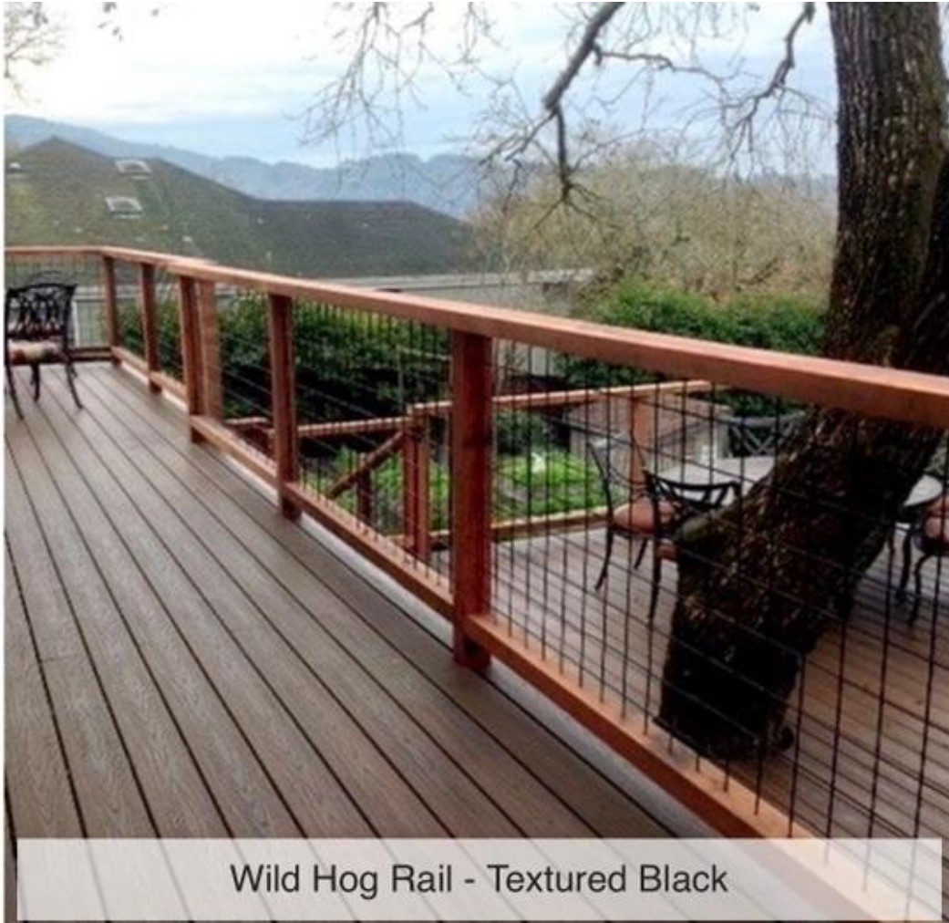
Wild Hog Rail - Textured Black