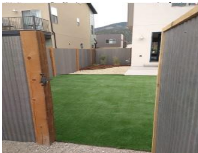
Vertical Metal Slats – Gray